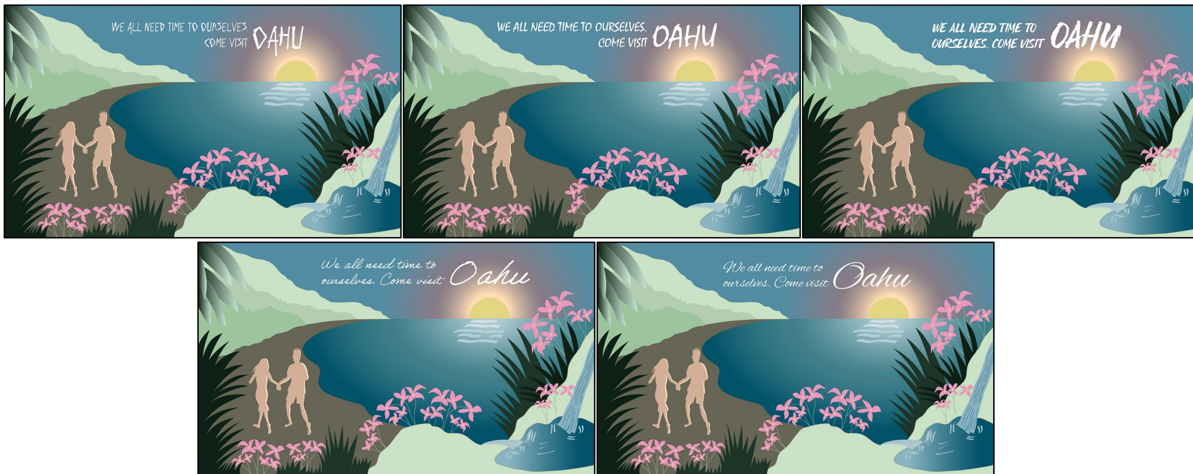
Font typefaces (left to right, top to bottom): 1) Flyerfonts Distortion, 2) Mistral, 3) Streaker Freaker, 4) Adobe Handwriting Ernie, 5) Alex Brush Regular